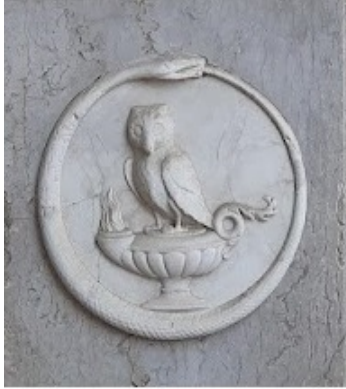
Image at Virgil's tomb is reminiscent of Ragnarok.