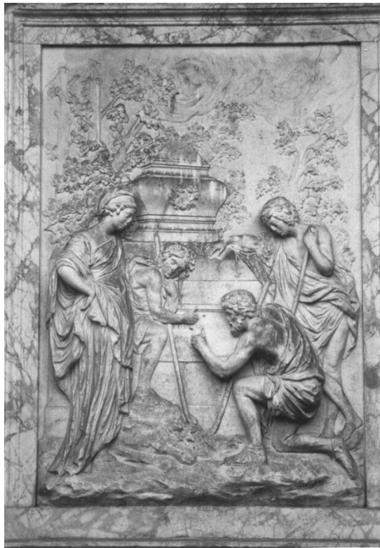
'Et in Arcadia Ego,' relief of painting by Poussin at Shugborough

The Shugborough Inscription is a sequence of letters 'OUOSVAVV' on the first line and 'DM' spaced far apart on the second line. It is on a monument built between 1748 and 1756 commissioned by Thomas Anson. Above it is a relief by sculptor Peter Scheemakers which is a variation of the Poussin painting Et in Arcadia ego . The famous painting by Nicolas Poussin displays this inscription on a tomb. It translates from Latin as 'I am also in Arcadia.' This inscription has eleven letters on top and three on bottom. The Poussin painting was done in 1637-1638. He did an earlier version in 1627. Previous to this Guercino painted a similar but different version in 1618-1622. The original inspiration is a poem by Roman poet Virgil known as Eclogues . In this poem from 40 BC the inscription on the tomb of Daphnis is described. The tomb is in 'Arcades.' Daphnis was a shepherd in ancient Greek mythology.