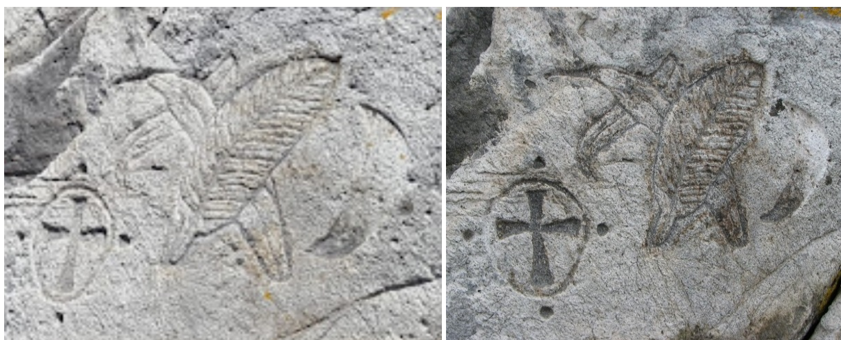
Upper carving on Stone.

Henricus 1116-1117 (at) site Bael's cup, (the) pole tie. Daggers hit pole (and it) turned. Baal hit (the) peg (at the) arc (and) hole. 1123-1124.