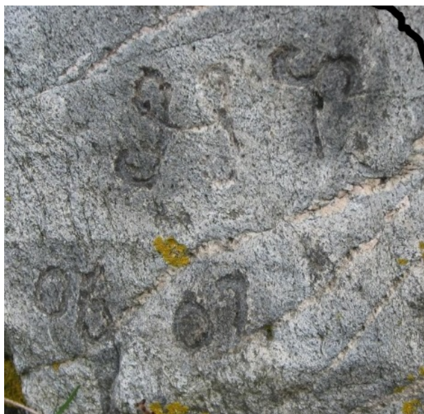
Lower Carving on Stone

The second inscription is more weathered probably due to its lower position on the stone in a climate with a lot of snow. Typically the bottom two portions are read as 06 07 which are Arabic numerals. These were in use within mathematical circles in Europe before the 1100's. If the intention was to emphasize these, then they suggest a date of inscription of 1206-1207 for reasons as stated above. It is more likely they have nothing to do with a date at all for they are not just an 06 and 07. The images here show this is what we want to see because that is what we expect and what is actually there seems ...well...odd.