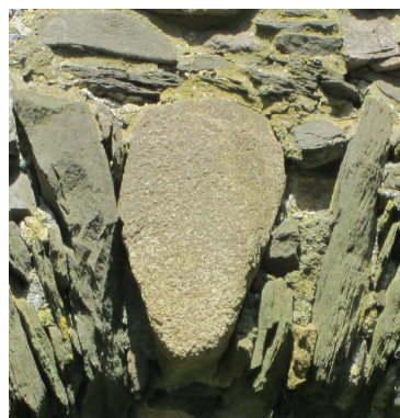
Round Sunstone on Interior

The structure is set up to provide numbers as well. There are 8 pillars and 10 symbols that appear on five arches (two each). One symbol (the round sunstone) is in the inside and three arches