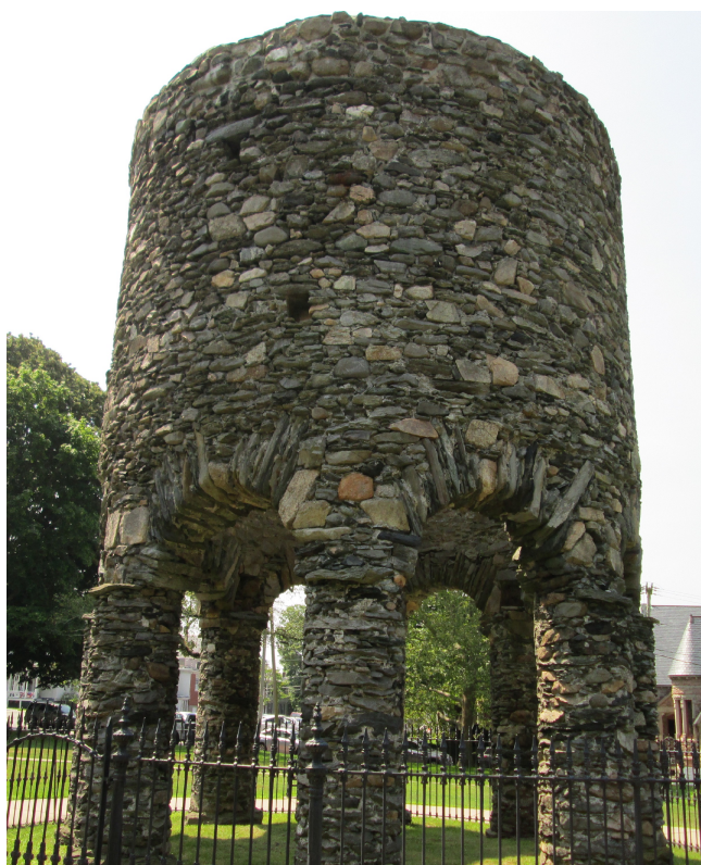
OM on side of tower. O is round stone. M is formed by two arches.

One may again conclude after finding so many numbers typically found in Baalist documents that the transliteration is correct. Let us view this another way. There are 3 arches with only 1 symbol. This is part of the story of Baal. There are 3 arcs.✓ The repeating 2's emphasize that there were 2 Baals ✓.